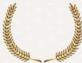
Soumik Chakrabarty, Trainer